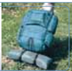
Attaches to Backpacks