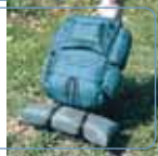
Attaches to Backpacks