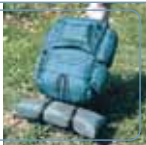
Attaches to Backpacks